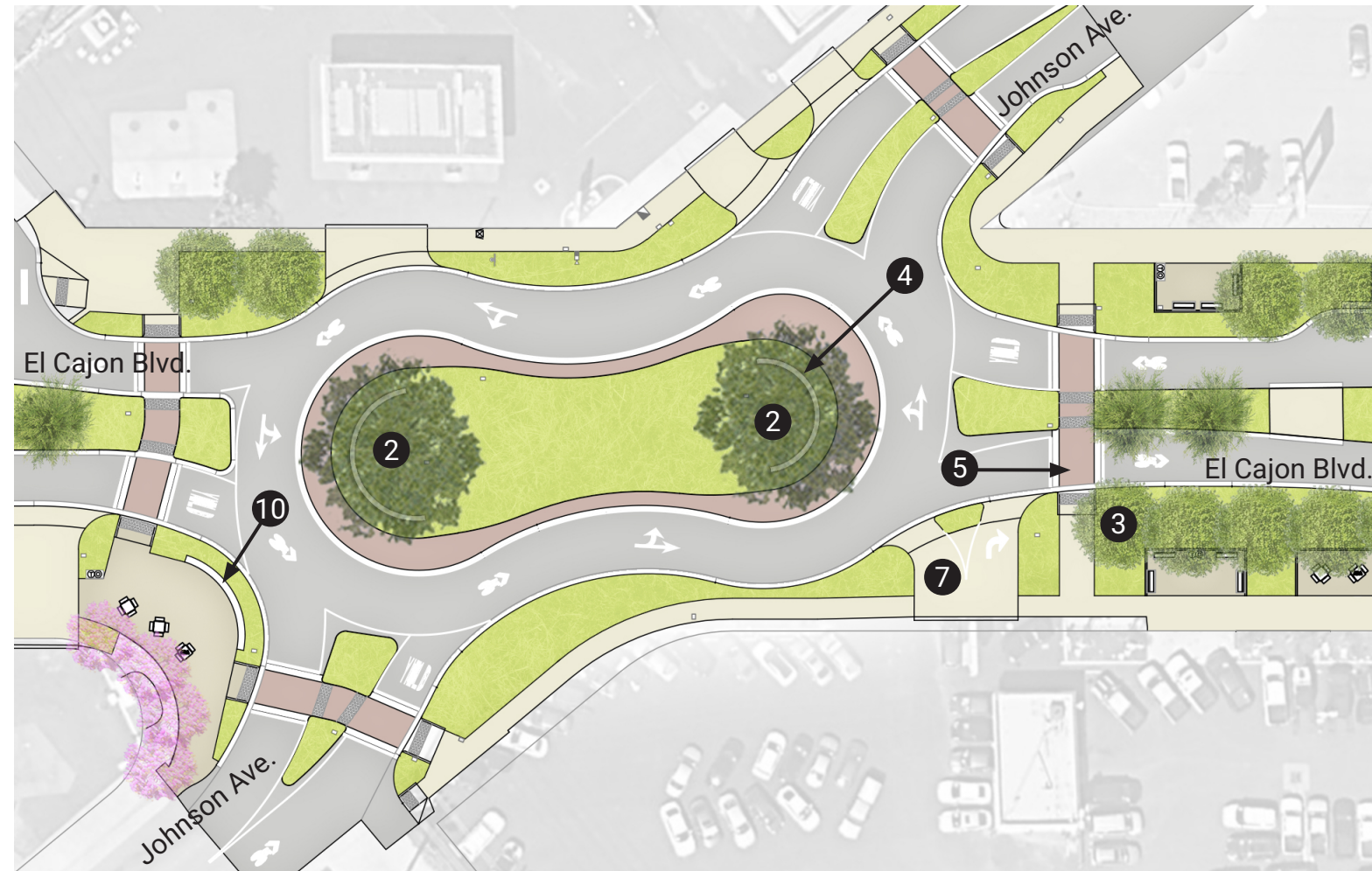
Enlargement 2: Roundabout at El Cajon Boulevard and Johnson Avenue